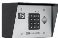
SHD-J with 101-DE

Mounting Kits & Angle Brackets - See page 11