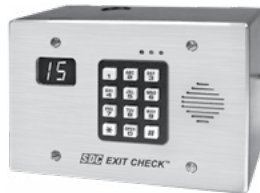
101-DE with DEC-J

1576DE-ZB Inswing mounting bracket for 1576DEU 161.00