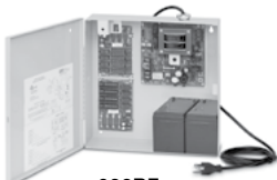
632RF with optional power cord and 2 - CR4 modules