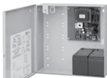
602RF / 631RF