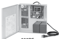
632RF with optional power cord and 2 - CR4 modules