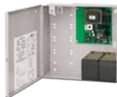
602RF 1 Amp, 12/24 VDC Class 2 Output Power Supply