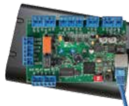
IPPro IP-based Access Control Controller