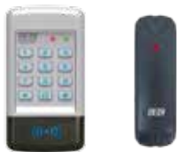
920 Wiegand IPRW Access Control Keypad or Reader