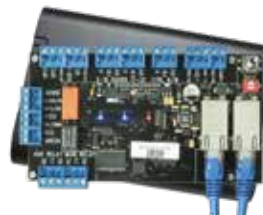
IPPro IP-based Access Control Controller