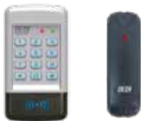
920 IPRW Wiegand Access Control Keypad or Reader