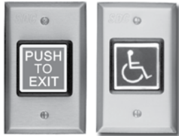
422 422A 423 423A 424

2" Button, Green and Red Illuminated Lens included - Dull Stainless Steel Finish