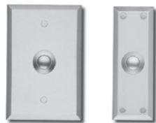
451 451N 452 452N 453 453N