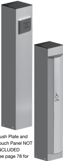
Push Plate and Touch Panel NOT INCLUDED see page 78 for ordering info