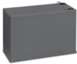
RB12V7 7 Amp Hour