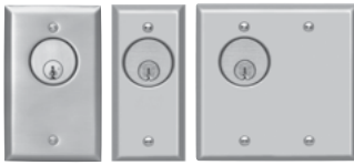
700 700N 700T