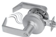
Electra Pro™ Z7250E