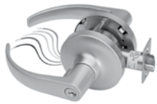
Electra Pro™ Z7250G