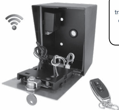
926 with WRC Wireless Receiver and Pendant Transmitter

The perfect companion for the 926 EntryCheck is SDC's WRC Series 2-Channel wireless transmitter/receiver solution . Specifically designed to be used as a remote release for single or dual door access control applications. Receiver has the capacity to learn up to 30 fixed transmitter codes using the onboard learning button and status LED. The WRC-R2 Receiver fits perfectly inside the 926 housing.