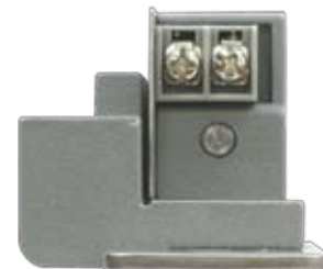
Screw terminal connections