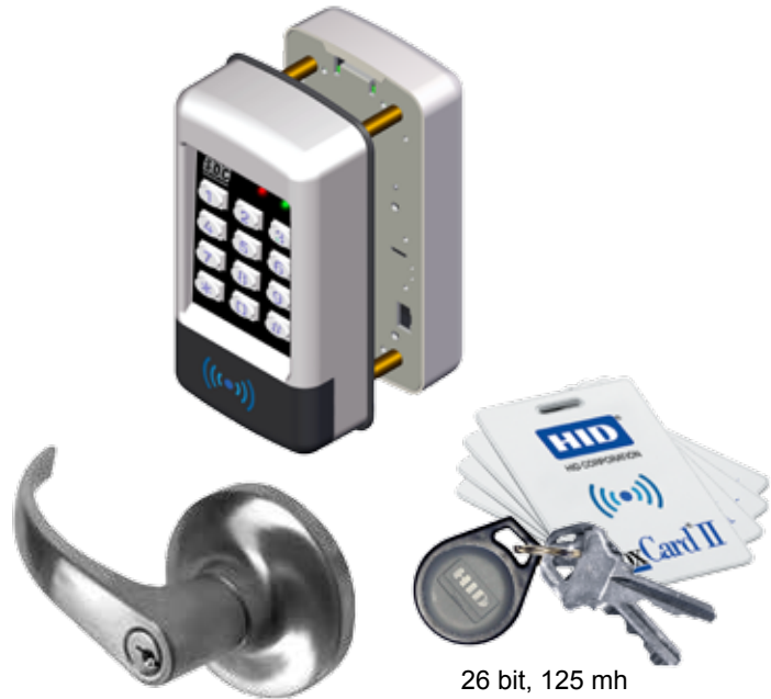
26 bit, 125 mh