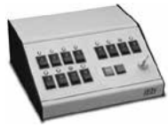
TCC AL8 AL4E