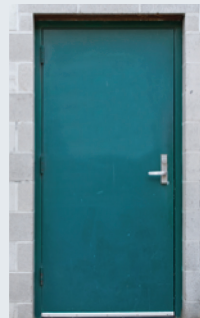
» Hollow Metal