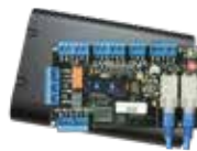
IP Pro IP-based Access Control