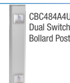
CBC484A4U Dual Switch Bollard Post