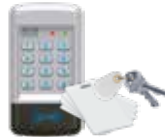
Entry Check™ 920PW