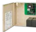
602RF 1 Amp 631RF 1.5 Amp 632RF 2 Amp 634RF 4 Amp 636RF 6 Amp

12/24VDC, Class 2 • Fire release input • System Status LED's • Multiple Fused Outputs • Multiple Relay Configurations • Universal Programmable Controllers