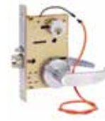
Z7850 x REX x DPS Electrified Mortise Lock