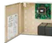
631RF 1.5 Amp, 12/24 VDC Class 2 Output Power Supply