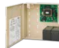
631RF 1.5 Amp, 12/24 VDC Class 2 Output Power Supply