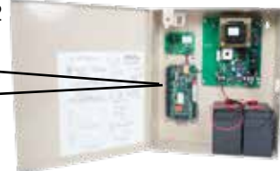
602RF x IPDC x 12VR

RB12V4 Optional Backup Batteries 12V/5Ah