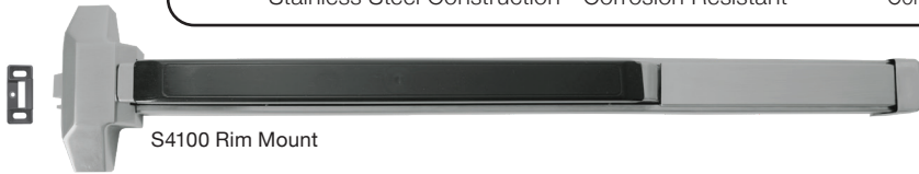
S4100 Rim Mount