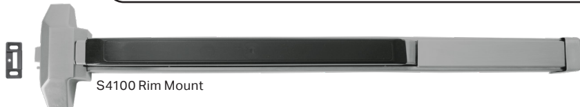
S4100 Rim Mount