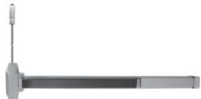
Less Bottom Rod