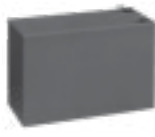
RB12V7 8 Amp Hour