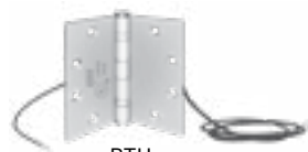
PTH UL 10B Listed for 3Hr Fire Rated Doors See page 97